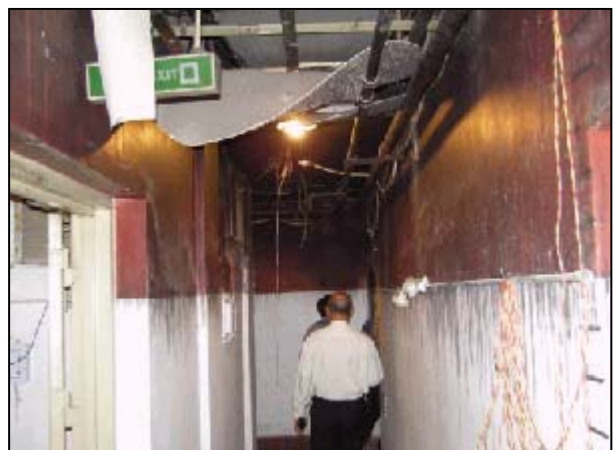
At the High Rise Fire Test Building