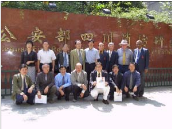
The IFES delegation to SCFRI